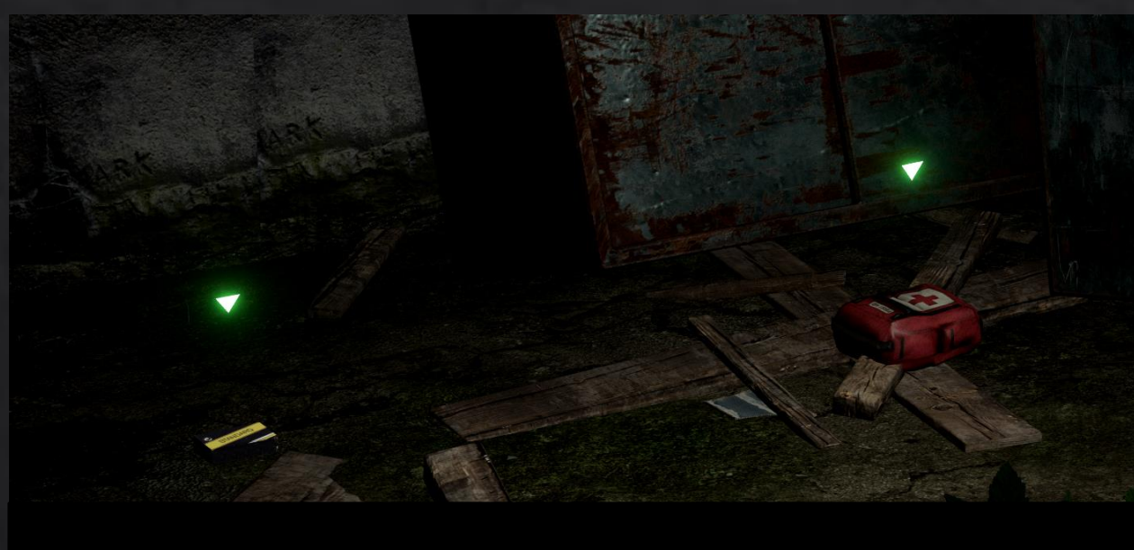
Ammo and Health Pickup